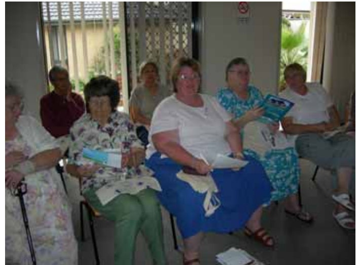
Residents from 99-101 Coleman Street and 1-3 Vincent Street discussing their project idea

Currently quotes and prices are being sought and the group is determined to make the best use possible with the funds that are available.