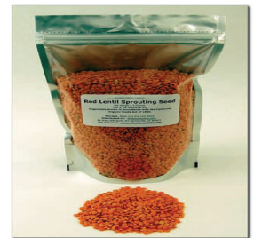
Lentils labelled correctly