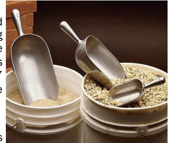
Scoops for decanting foods

When foods are repackaged into smaller containers, food handlers need to ensure that there are appropriate sanitising facilities for the scoops and other utensils used for the repackaging of foods. The minimum requirements for sanitising is a double bowl sink that can deliver a hot water temperature of 77 °C. In addition, a chemical sanitiser will assist when cleaning the scoops and other utensils used.